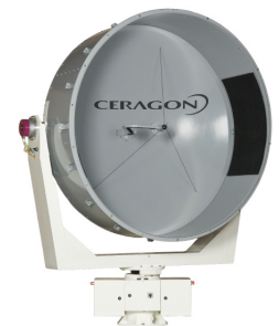
PointLink MK 2.0m/6.6ft Dual Axis

Microwave radio link system for offshore communication