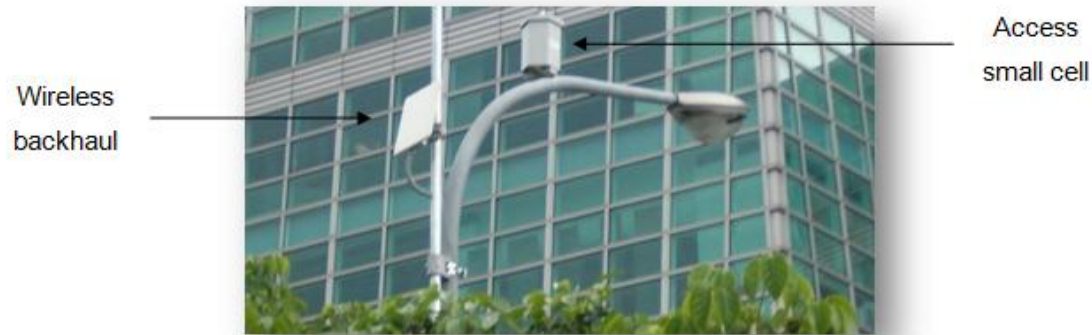
Figure 4: Sub 6 GHz Deployment on a Lamppost