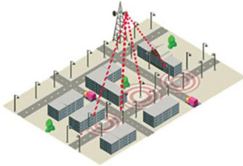
Figure 5: Sub 6 GHz Point-to-Multipoint Backhaul Links