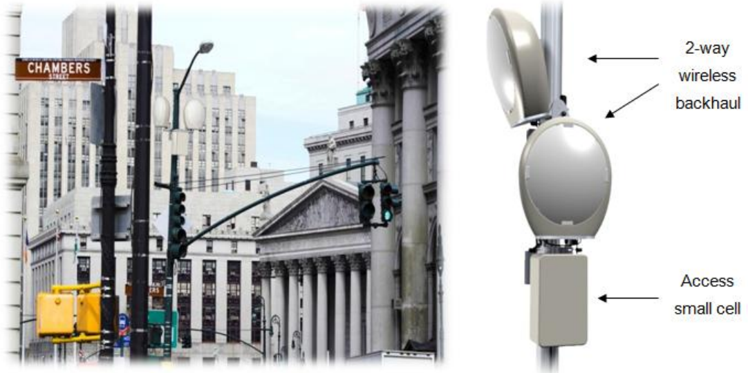
Figure 2: Ceragon's E-Band Solution