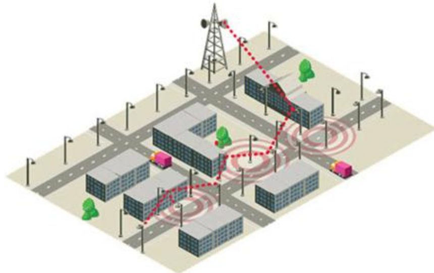
Figure 3: Sub 6 GHz Links on an Urban Street