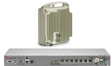
FibeAir IP-10 , Carrier Ethernet Wireless Solution